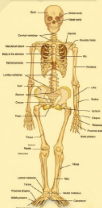
The Human Skeleton